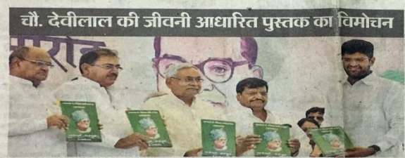
चौ. देवीलाल की जीवनी आधारित पुस्तक का विमोचन

कुरुनाल | इनेलो ने सीएम मनोहर लाल के गढ़ में चौधरी देवीलाल के 103वें जन्म दिन और डॉ. भीमराव आम्बेडकर के 125वें जन्म दिवस समारोह के उपलक्ष्य में सद्भावना दिवस एवं सम्मान समारोह आयोजित कर अपनी शक्ति का प्रदर्शन किया। इनेलो नेताओं ने सीएम मनोहर लाल पर कम प्रधानमंत्री नरेंद्र मोदी पर अधिक निशाना सादा। प्रदेश व राष्ट्र के लिए चौधरी देवीलाल के कार्यों को जनता के सामने रखकर अपने पक्ष में समर्थन मांगा और तीसरे मोर्चे को कांग्रेस व भाजपा के विकल्प के रूप में मजबूत बनाने की पर जोर दिया। जाट आरक्षण आंदोलन के दौरान हुए जान-माल के नुकसान के लिए प्रदेश के सीएम को भी आड़े हाथों लिया। इधर देर शाम रैली के बाद कैथल रोड प्लाईओवर जाम लग गया। इससे शहर के लोगों को काफी परेशानी हुई।