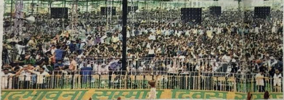
कुरुनाल, इनेलो रैली में उपस्थित जनसमूह।

जितना कठिन संघर्ष होगा उतनी शानदार जीत होगी